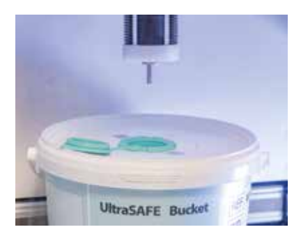
Formalin is added until the preset ratio is achieved (formalin/ weight of specimen)