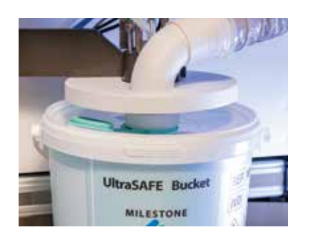
The automatic filling system is lowered and the dispensing nozzle penetrates the seal valve