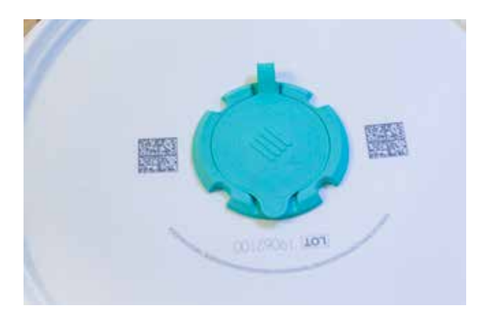
Closed quadricuspid valve during trasportation and storage