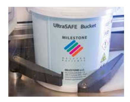
The bucket is automatically centered and the weight of the biospecimen is detected